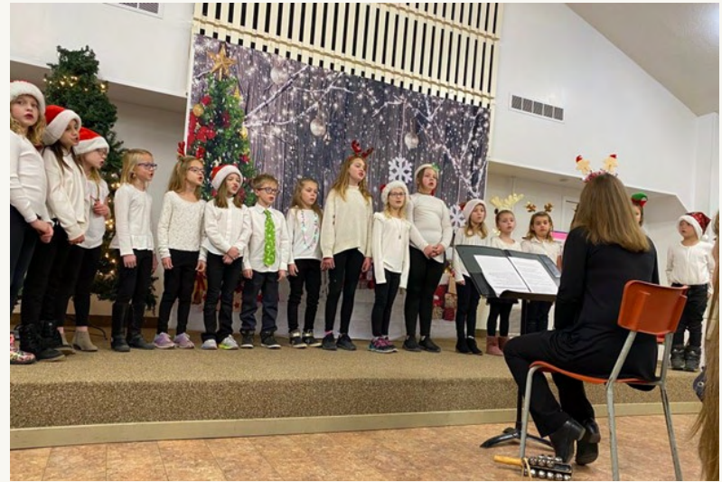
Choir singing carols at the Alcomdale Christmas Market