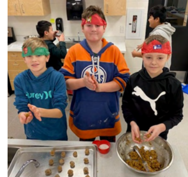
Gr 7 Math Challenge and Gingerbread!