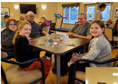
Grade 3's making crafts, singing carols and playing games with Seniors at West Country Hearth