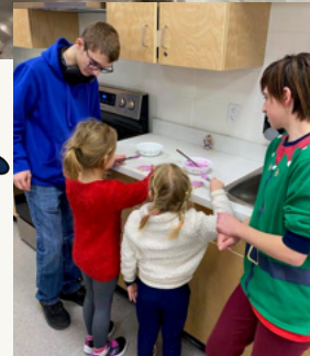
Junior High Baking and Decorating Class baked and decorated cookies with the Kindergarten class