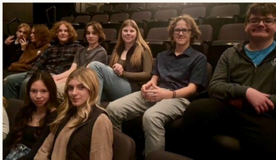
Grade 9s Field Trip to the Christmas Carol