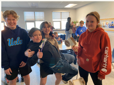
Grade 7 Social