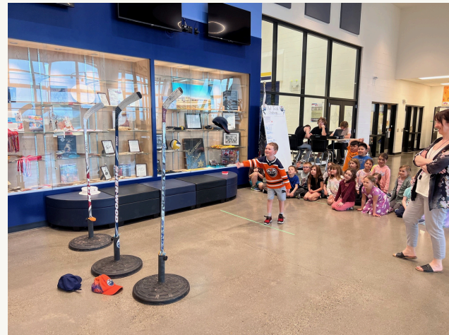
Go Oilers!! Get a Hattrick and win a prize!