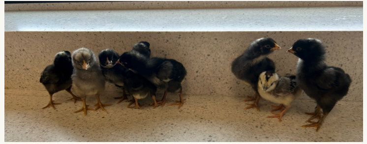
IN GRADE 9, WE HATCHED A VARIETY OF CHICKS TO DISCUSS VARIATION AND TRAITS! LOOK WHO JOINED US LAST WEEK.