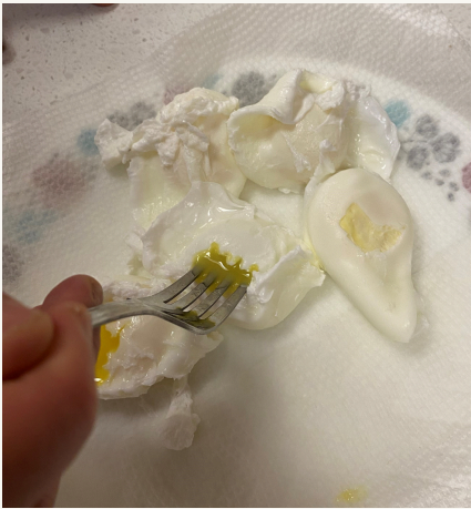
Healthy Eating options worked on creating the "Perfect Poached Egg: