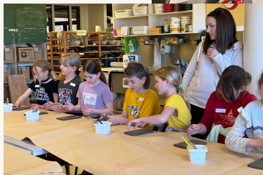
Grade 3's enjoyed their field trip to the Arts & Musee Heritage Museum