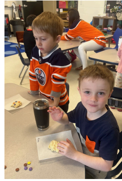
Baked cookies and decorated with smarties creating a pattern!