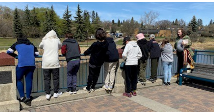
Grade 7 St. Albert River Walk and the Louis Riel mock Trial in Social 7