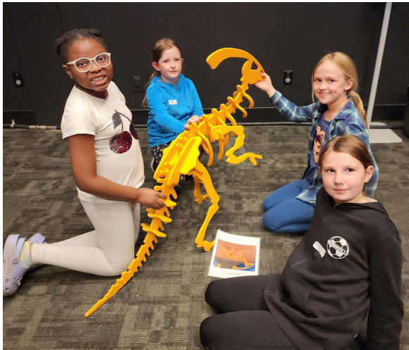
Grade 4 Had a great field trip to the Telus World of Science